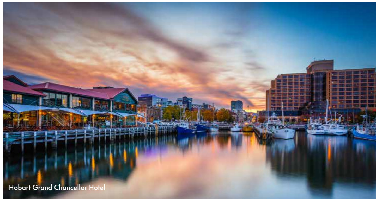
Hobart Grand Chancellor Hotel