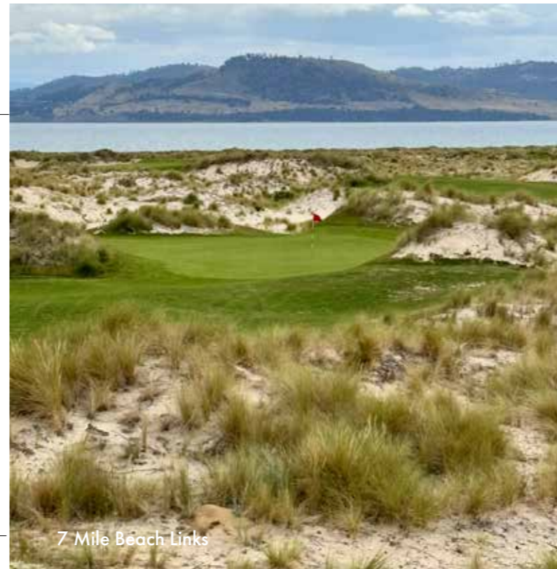
7 Mile Beach Links

A detailed electronic itinerary can be downloaded on your laptop, iPad or smartphone, enabling you to review tour highlights and access daily updates while on tour.