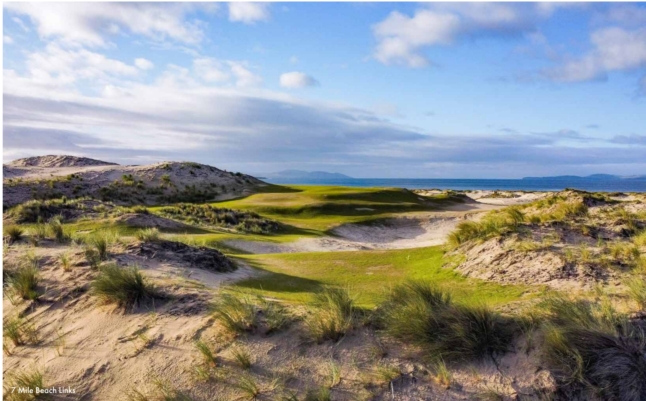
7 Mile Beach Links