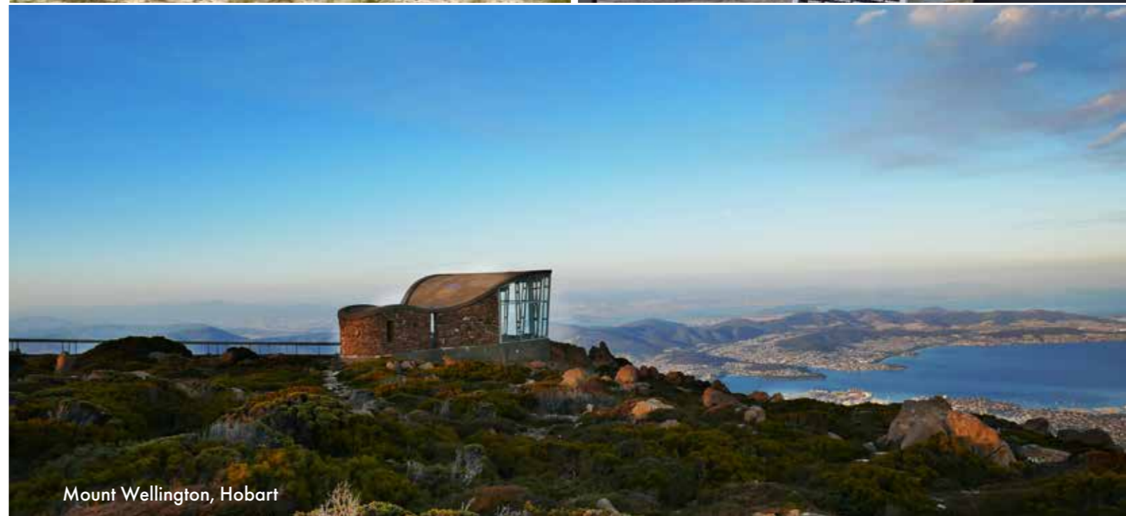
Mount Wellington, Hobart