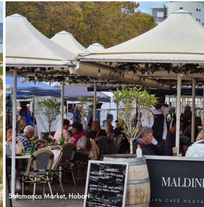
Salamanca Market, Hobart