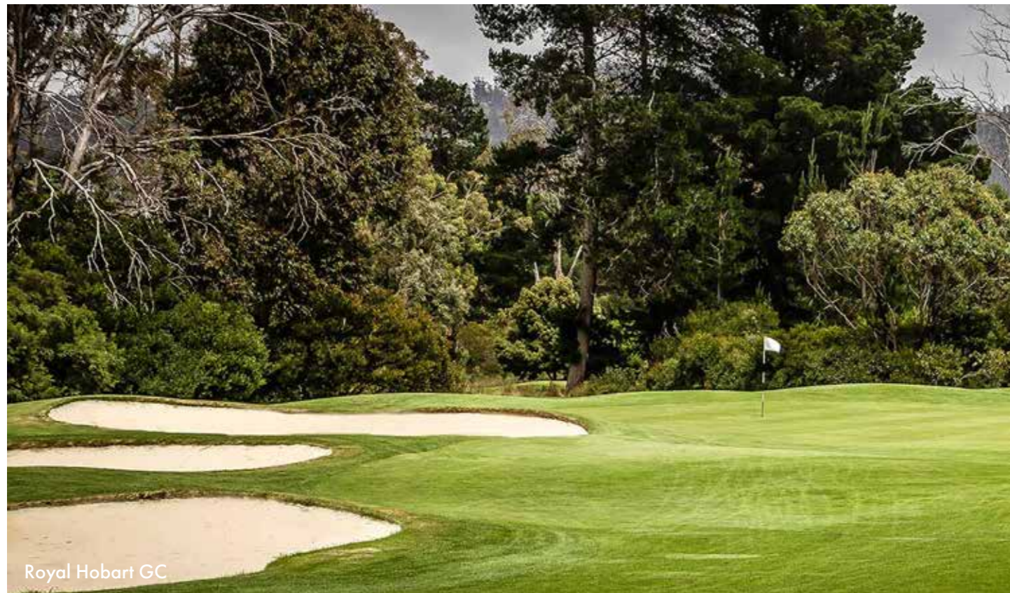
Royal Hobart GC